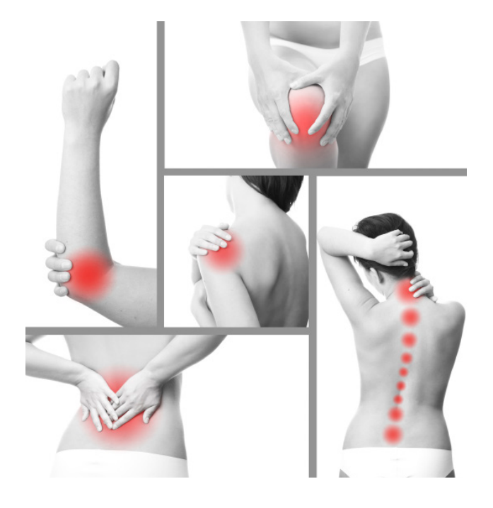
'Leading the way in therapeutic physiotherapy healthcare'